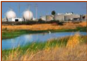
Sacramento Regional Wastewater Treatment Plant

The Sacramento Regional County Sanitation District, Sacramento Regional Wastewater Treatment Plant in Elk Grove, California, sponsored and conducted this test over a period of 3 months and documented the results of the field-test in this report of 3 Cl 2 and 2 SO 2 Analyzers.